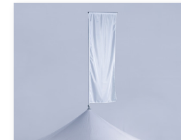
Printable Peak Flags