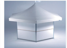
Locking Upper Closure Panels