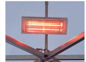
Mounted Infrared Heaters